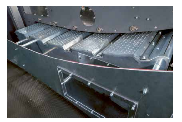
Bi-level drying tunnel with a small footprint and outstanding drying capacity

At the final dryer stage, a newly designed drying tunnel comes into play for outstanding drying capacity, which is particularly beneficial when using water-based inks and printing on plastic films. The concept is based on a bi-level arrangement of the drying elements which dramatically reduces the footprint of the machine. Besides that, its compact design made it possible to reduce the total substrate travel length in the machine to such an extent that a considerable waste reduction can be achieved during start-up. At the same time, due to clever engineering, accessibility to the drying units has been improved, which simplifies maintenance tasks.