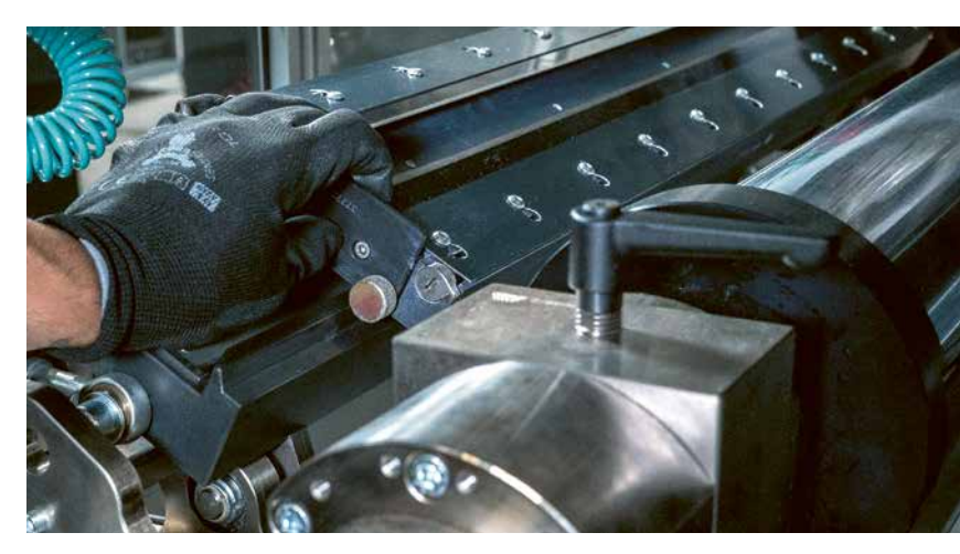
Quick and clean blade change with an advanced clamping system

Smooth and consistent doctoring of the anilox is essential for constant and reproducible printing. We have developed a chamber doctor blade system which is generally suitable for use without modification – regardless the printing application – and achieves outstanding printing results. Adjustments are made automatically for accurate and fast job changeovers. A fast clamping system and extra long-lasting doctor blades make for easy operation and low maintenance. An optimized interior geometry of the chamber with a reduced volume results in additional ink savings and ensures smooth operation with hardly any ink spitting.