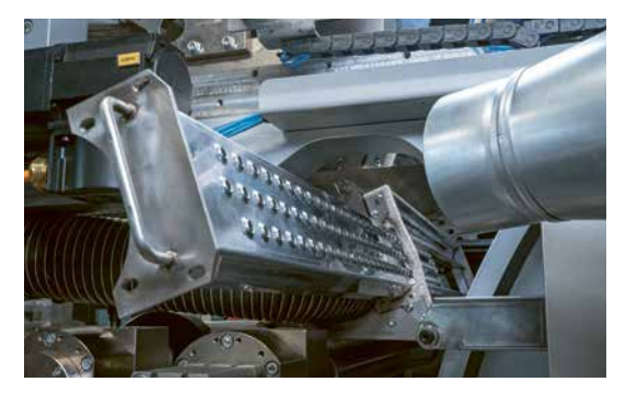
Optimized configuration creates homogenous heat transfer and improves drying capacity

The printing industry demands efficient drying of solvents and water-based inks for both inter-deck as well as final dryer stages. In order to meet these demands, Koenig & Bauer has introduced an enhanced inter-color drying